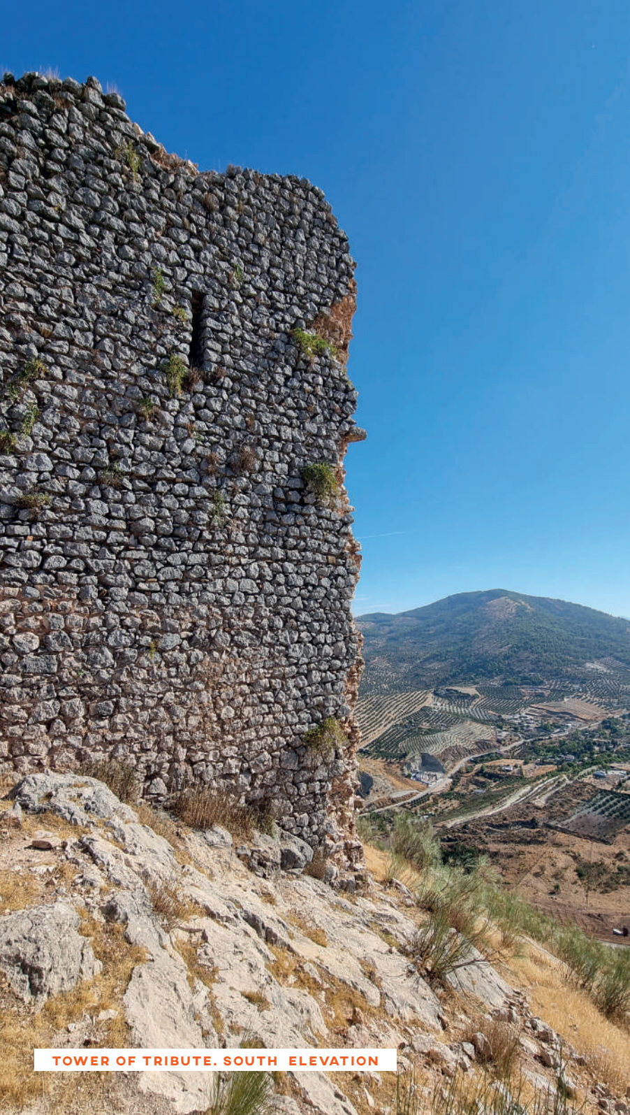
TOWER OF TRIBUTE. SOUTH ELEVATION